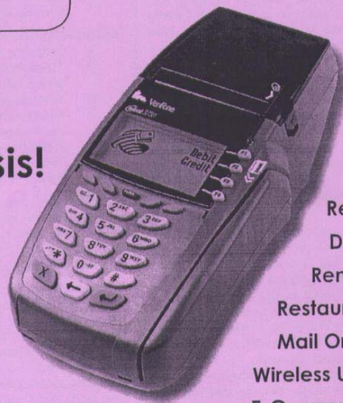
VeriFone Omni 3730LE

Retail Debit Rentals Restaurant Mail Order Wireless Units E-Commerce